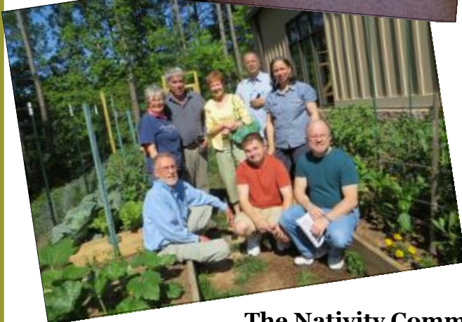
The Nativity Community Gardeners