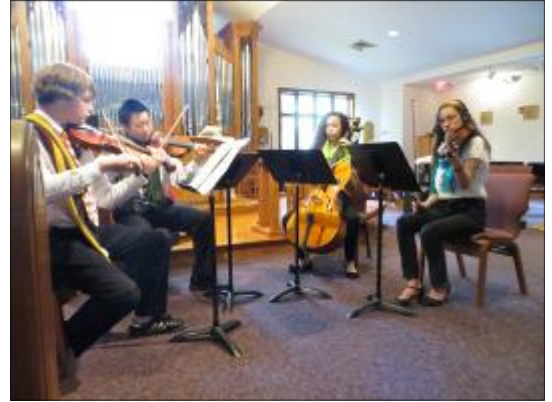
Tosca, Tunes and Tofu: Take 10

Thank you, to all the talented musicians!