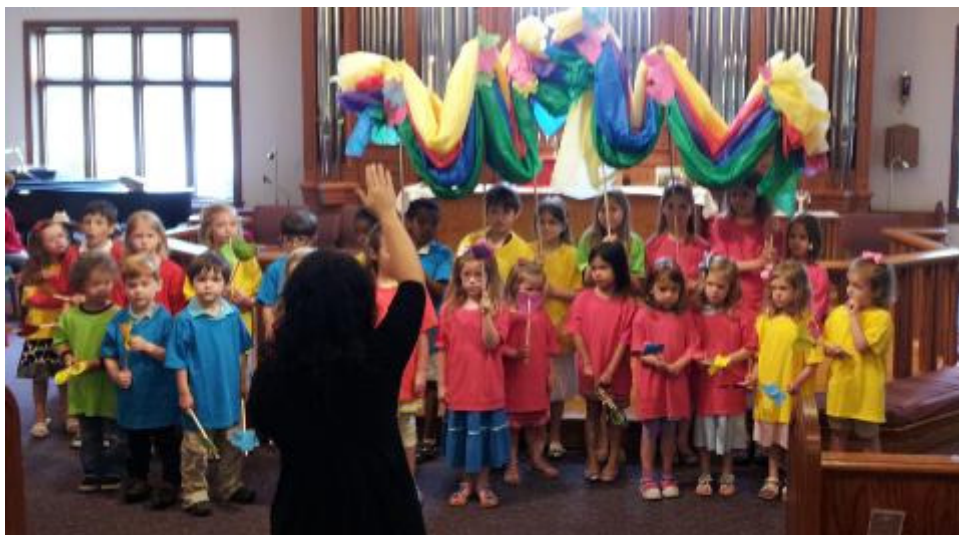
Beautiful music from our youngest musicians

Youth Sunday was a day our youth truly brought the Holy Spirit to us all. From the youngest musicians to the eldest...the J2A class greeting us at the door...our acolytes doing what