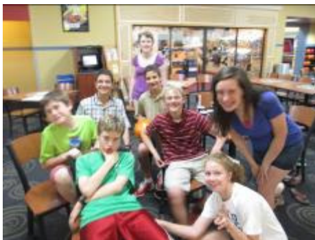
Fun times for the Youth Group, bowling and spending time together