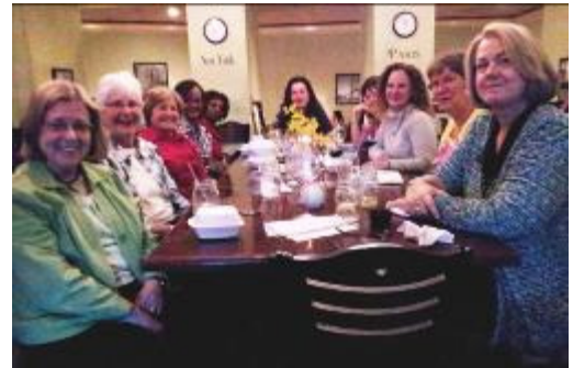
Getting to know one another: the members of the Altar Guild met for dinner and conversation at Relish restaurant.