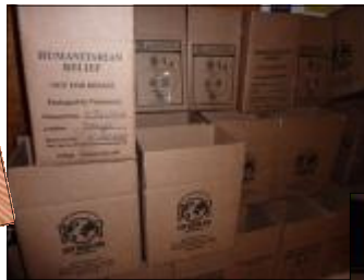
On April 28, about 150 Nativity parishioners packed 10,000 meals for Stop Hunger Now in about an hour's time. It was a wonderful afternoon of fellowship and outreach.