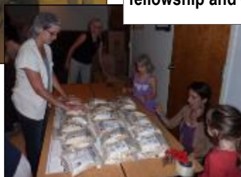
Go to http://nativityonline.org/event-items/nativity-packing-10000-meals/ to view a slideshow of all the pictures taken that day.