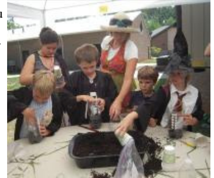
Vacation Bible School 2012 Adventures at Hogwarts!