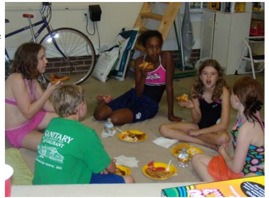
Fixers Swim Party

All of the classes will have an opportunity to participate in the Diocesan Youth Outreach day on Saturday, Oct 16 where they will work together to clean up debris at a Durham church and meet other youth group members from this area.